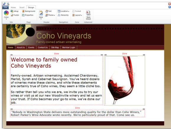
Easy-to-use web-based design tools

Manage and share important documents to keep teams in synch, with SharePoint Online.